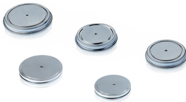
ABB presents new high frequency welding diodes with following features:

ABB Semiconductors' first-class welding diodes assure successful performance